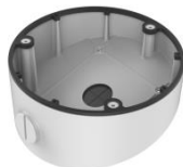
DS-1281ZJ-DM26 Inclined ceiling mount