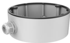
DS-1280ZJ-DM26 Junction box