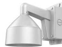
DS-1273ZJ-DM26-B Wall mount with junction box